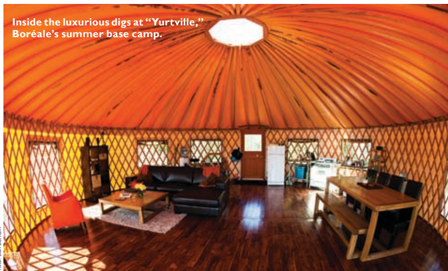
Inside the luxurious digs at “Yurtville,” Boréale's summer base camp.